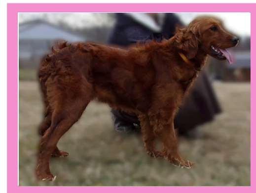
Sierra (Irish Setter/Golden Retriever)