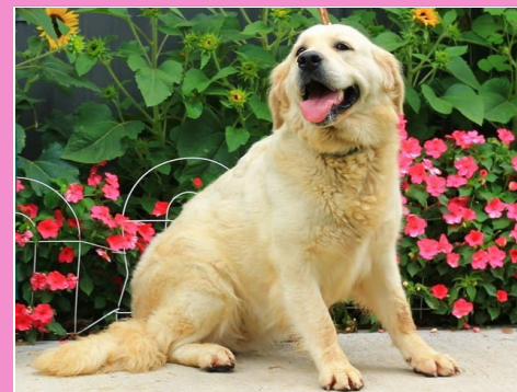
Snowflake (Golden Retriever)