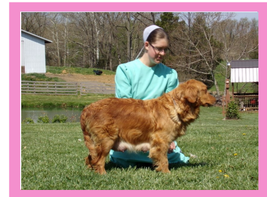
Felicity (Golden Retriever)